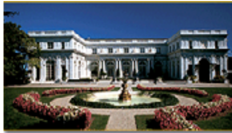
The "Rosecliff" at 548 Bellevue Avenue, Newport, RI.

If you would like to get together before the concert for a day trip, cruise, or dinner, please let us know when returning your reservation slip below. For directions to Newport and the Rosecliff, as well as for suggestions for overnight stays, please refer to the notes overleaf.